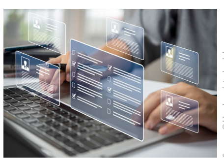
The aim is for 80 per cent of EU citizens and companies to be able to provide proof of their identity online across the EU by 2030.

Of relevance to social security are the pension claim procedure, pension rights information, the European Health Insurance Card and A1 process for proving payment of social security in the country of origin. The latter is the first project to be