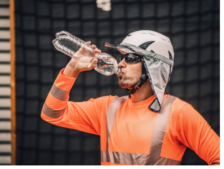
Appropriate preventive measures can protect employees from health risks resulting from heat

On 5 June 2024, the annual Heat Action Day will take place and numerous organisations at federal and regional state level are set to participate. The impact of heat is often underestimated. It may not only limit employees' performance but in individual cases it can even be life-threatening - especially when doing hard physical work. The DGUV therefore calls on companies to conduct risk assessments and, based on these, to develop heat protection concepts and protective measures. German social accident insurance institutions provide advice to companies on this issue. The aim of the national campaign is to raise awareness of health risks among the population. The central kick-off event and press conference will take place at the BG Hospital Berlin (Unfallkranken-