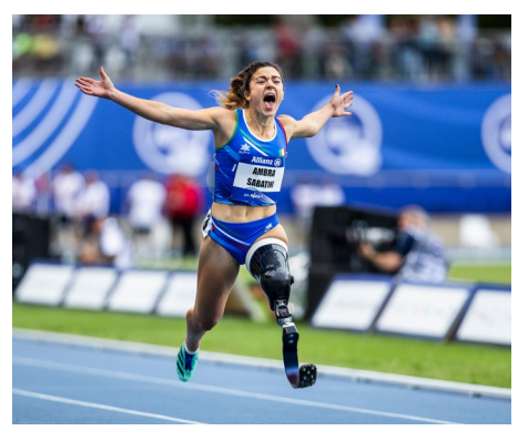
The winning photo "A scream, a victory".

Award Ceremony 2024: ... www.dguv.de/gpma (German only)