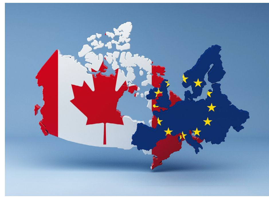
The planned free trade agreement between Canada and the EU – like the other free trade agreements – must not have a negative impact on social security

Free trade agreement between Canada and the EU nears completion